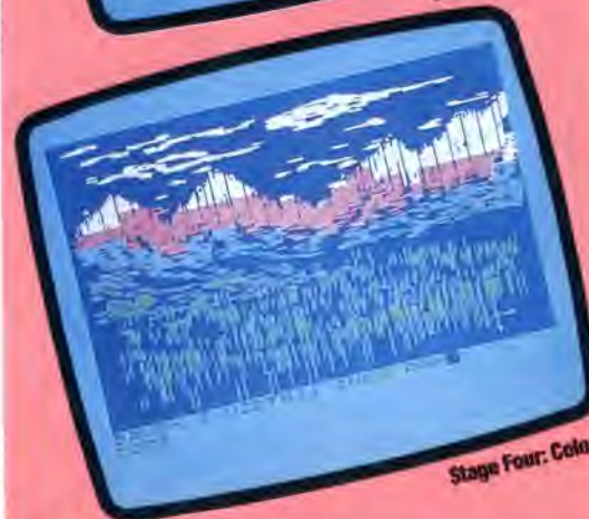
Stage Four: Colour