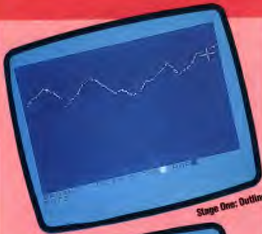
Stage One: Outline