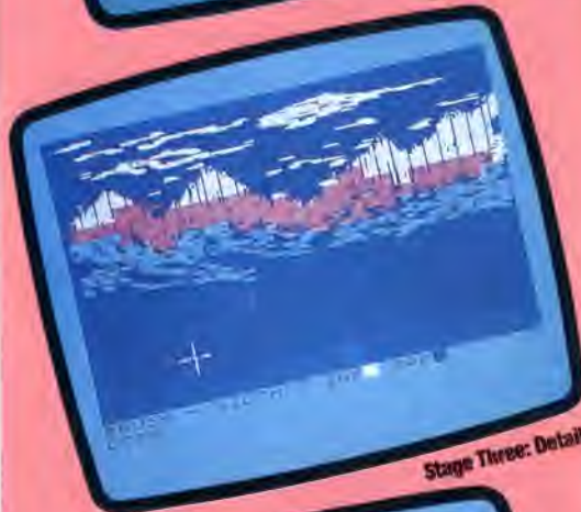
Stage Three: Details