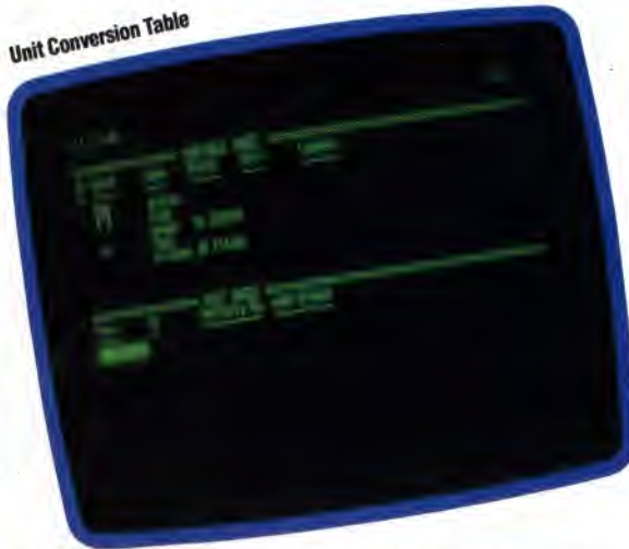
Unit Conversion Table

Press =R to restore the Rule sheet, then ; to move into the Variable sheet. We can now enter the defined names into the Unit column — m for distance; h for time; m/h for speed; g for fuel, and m/g for mileage. Blank all the current values and replace them with these: 1,247 for distance; 22.5 for time; and 43.9 for mileage. Press ! to solve, and the metric values are displayed.