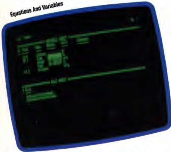
Equations And Variables

Press the semi-colon (;) key to move the cursor from the Rule sheet to the Variable sheet, into which we can now enter values. The cursor appears in the input column next to our first variable, distance. The following values are entered by typing them in the appropriate space, then pressing Return or the down arrow key.