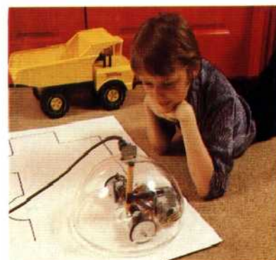
Introduce your child to the fascinating world of computers

Welcome to their dynamic world — and to THE HOME COMPUTER COURSE.