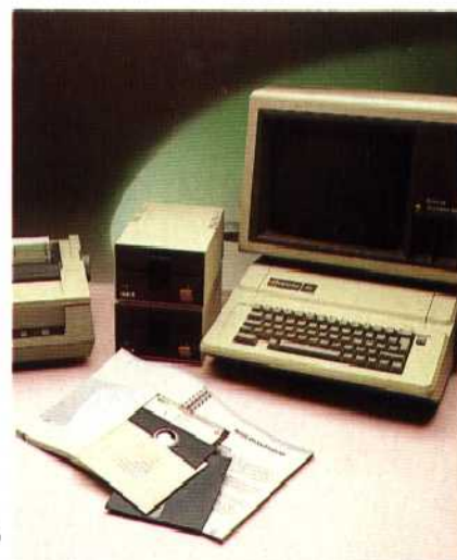
A step-by-step guide to computers — from basic principles to complete mastery

And there's more besides. We'll give you all the facts you need to tell one home computer from another. Every week we'll be taking a detailed — and critical — look at a popular model. So, by the end of the course, you'll be able to talk to any dealer with confidence, whether you're